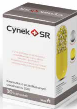
Strength and size: 86 mg x 30 prolonged-release capsules