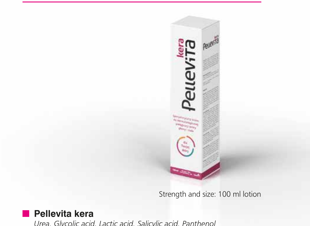
Strength and size: 100 ml lotion